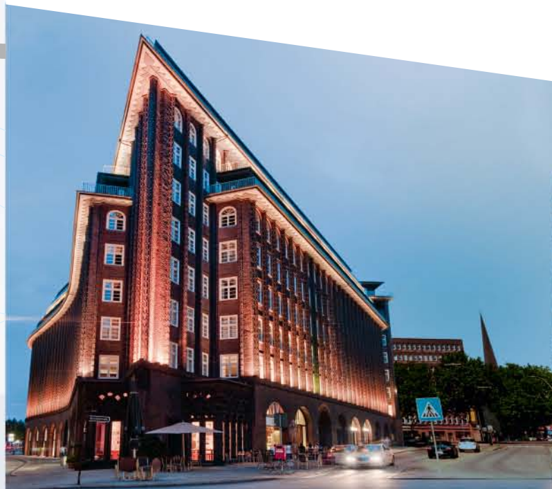
Designed by architect Fritz Höger, the Chilehaus was built between 1922 and 1924.