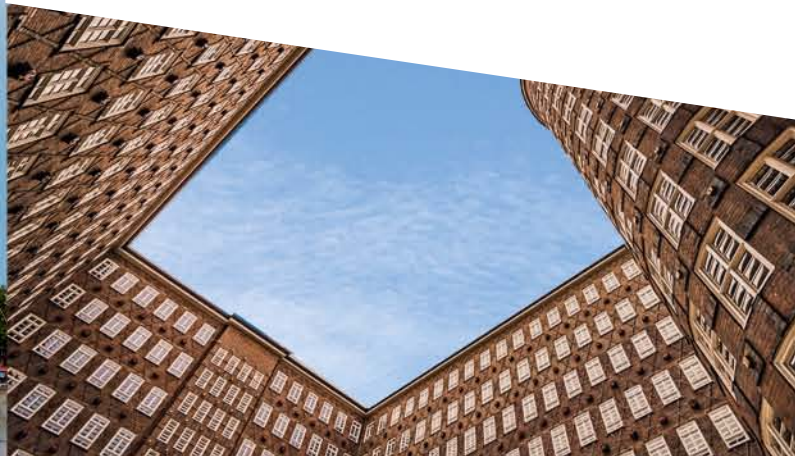
Fascinating office architecture: the Sprinkenhof with its modern clinker façades in Expressionist style.